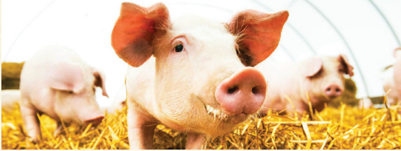
Animal feed from recycled organic byproduct

Our environmentally responsible, end-to-end organic waste recycling process offers our customers a new revenue stream and a partner to support their corporate sustainability and operational efficiency goals. We increase sustainability, reduce your environmental impact, and improve your business's bottom line.