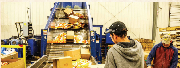
Certified product destruction